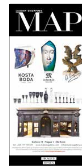
LUXURY SHOPPING MAP