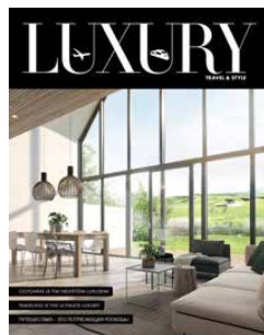
LUXURY TRAVEL & STYLE