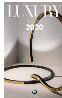
DESIGN & DEVELOPER